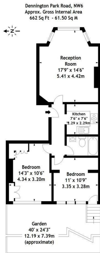
Raised Ground Floor

Measured in accordance with RICS guidelines. Every attempt is made to ensure accuracy, however all measurements are approximate. This floor plan is for illustrative purposes only and is not to scale. © Datagraphy Ltd 2017 Photographs * Floorplans * Virtual Tours Tel: 0845 643 4401 www.datagraphy.com