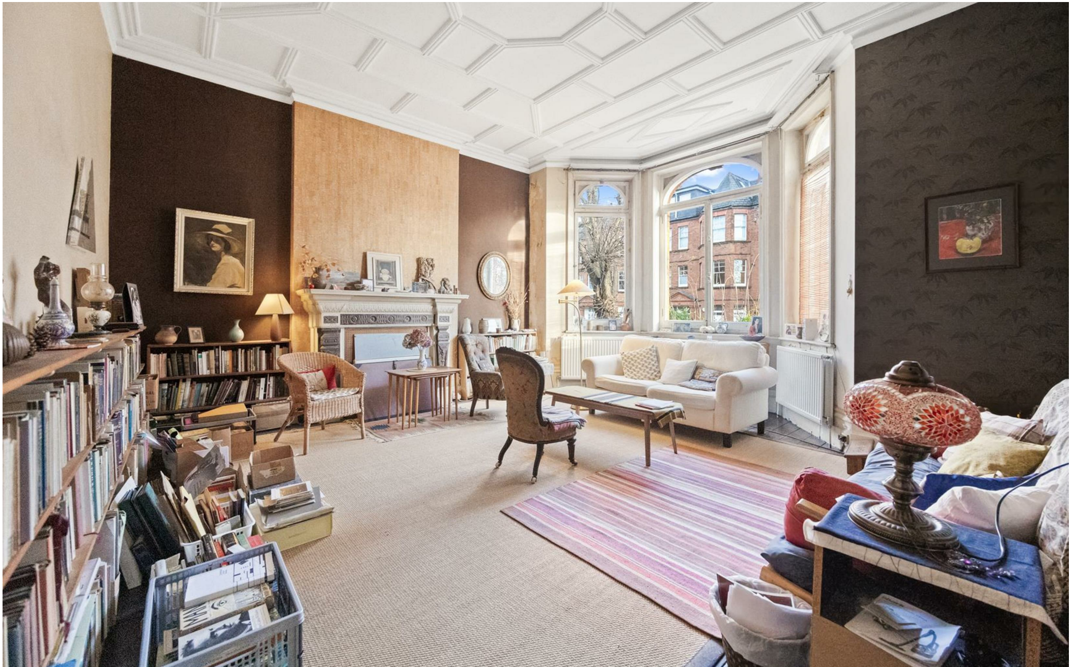
Compayne Gardens NW6