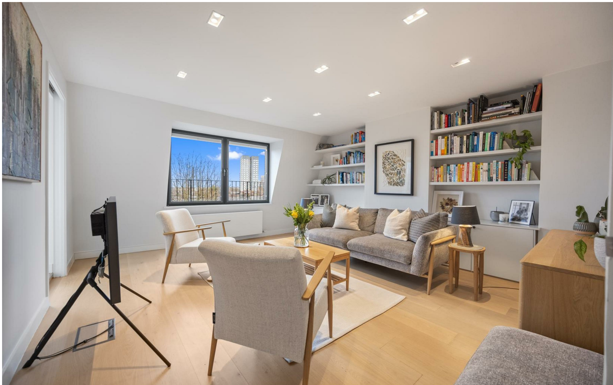
Greencroft Gardens NW6