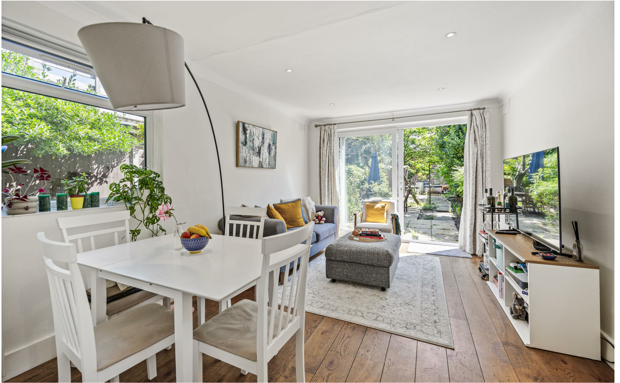
Goldhurst Terrace NW6