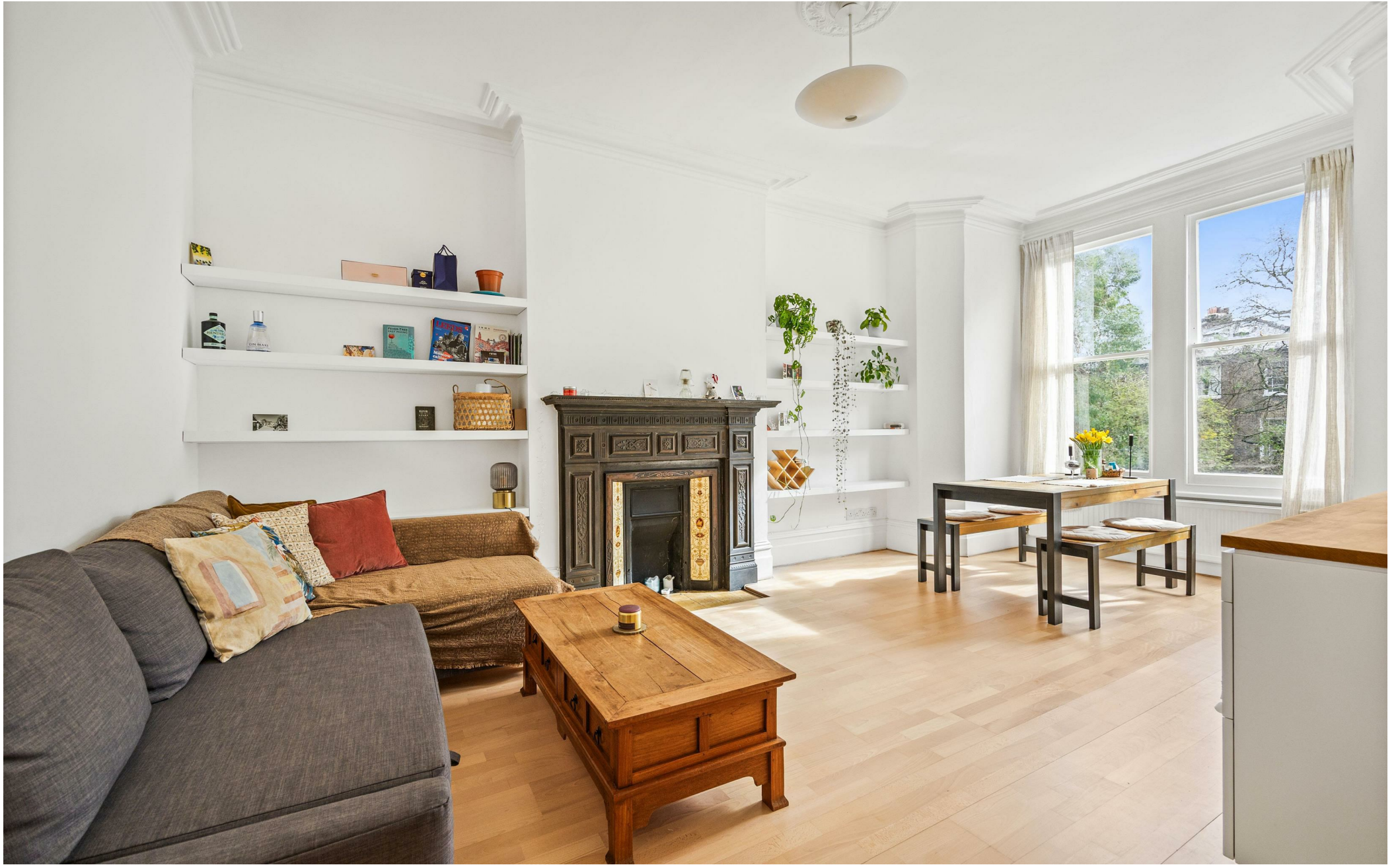
Goldhurst Terrace NW6