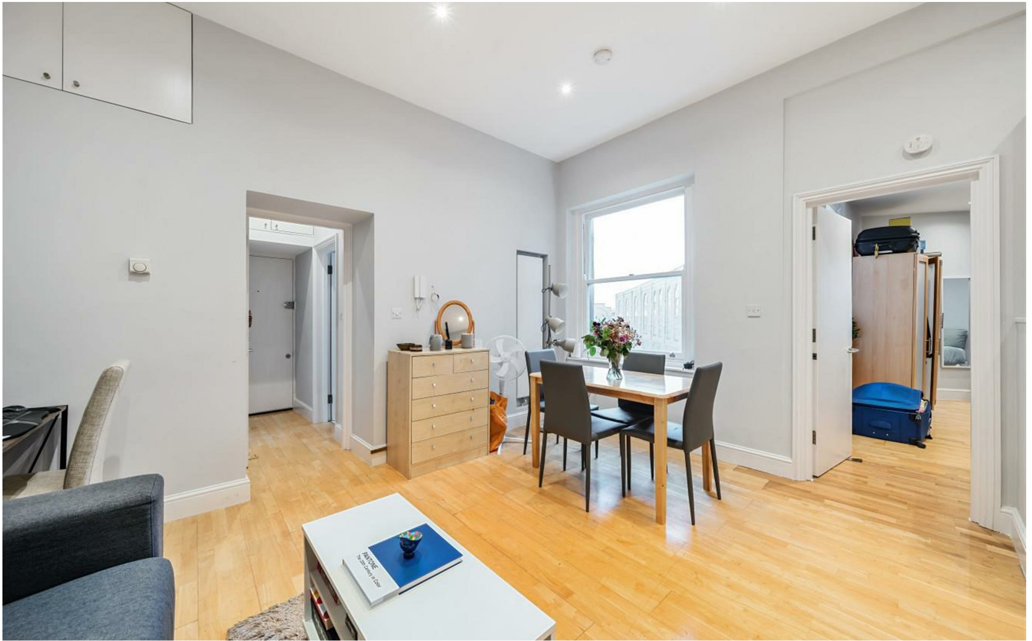
Canfield Gardens NW6