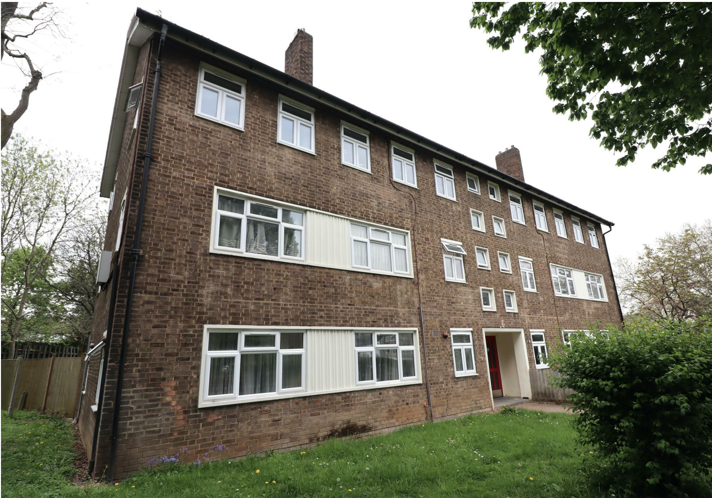
Corbett Grove, London, N22 8DQ

Offers are invited on this 2 bedroom apartment situated on the ground floor of this purpose built block and within walking distance of Bounds Green Tube Station (Piccadilly Line) and less than a mile to Alexandra Park and Palace, with local amenities also within close proximity.