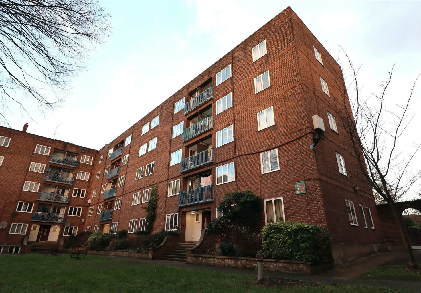
Kilburn Priory, London, NW6 5NE

Whilst every attempt has been made to ensure the accuracy of the floorplan contained here, measurements of doors, windows, rooms and any other items are approximate and no responsibility is taken for any error, omission or mis-statement. This plan is for illustrative purposes only and should be used as such by any prospective purchaser. The services, systems and appliances shown have not been tested and no guarantee as to their operability or efficiency can be given. Made with Metropix ©2023