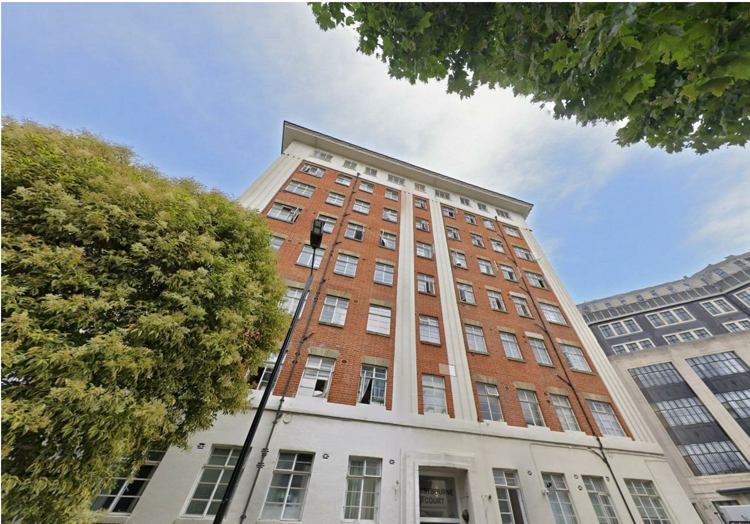
Orsett Terrace, London, W2 6AJ

Gravity Estates 18 Golders Green Road, NW11 8LL 02083570810 sales@gravity-estates.com www.gravity-estates.com