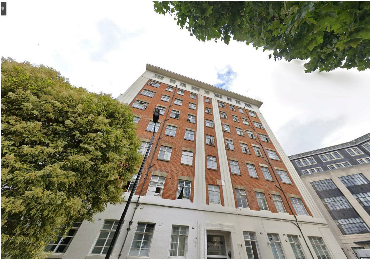
Orsett Terrace, London, W2 6AJ

Gravity Estates 18 Golders Green Road, NW11 8LL 02083570810 sales@gravity-estates.com www.gravity-estates.com