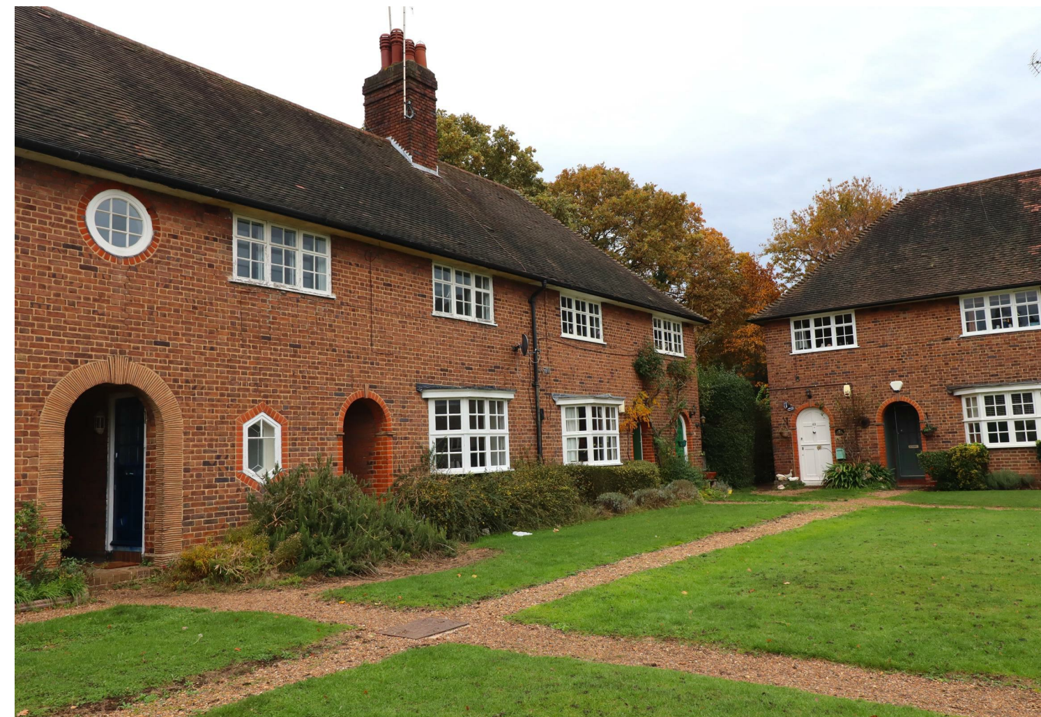
Hill Top, London, NW11 6EE

HILL TOP NW11 6EE TOTAL FLOOR AREA : 676 sq.ft. (62.8 sq.m.) approx. Whilst every attempt has been made to ensure the accuracy of the floorplan contained here, measurements of doors, windows, rooms and any other items are approximate and no responsibility is taken for any error, omission or mis-statement. This plan is for illustrative purposes only and should be used as such by any prospective purchaser. The services, systems and appliances shown have not been tested and no guarantee as to their operability or efficiency can be given. Made with Metropix ©2023