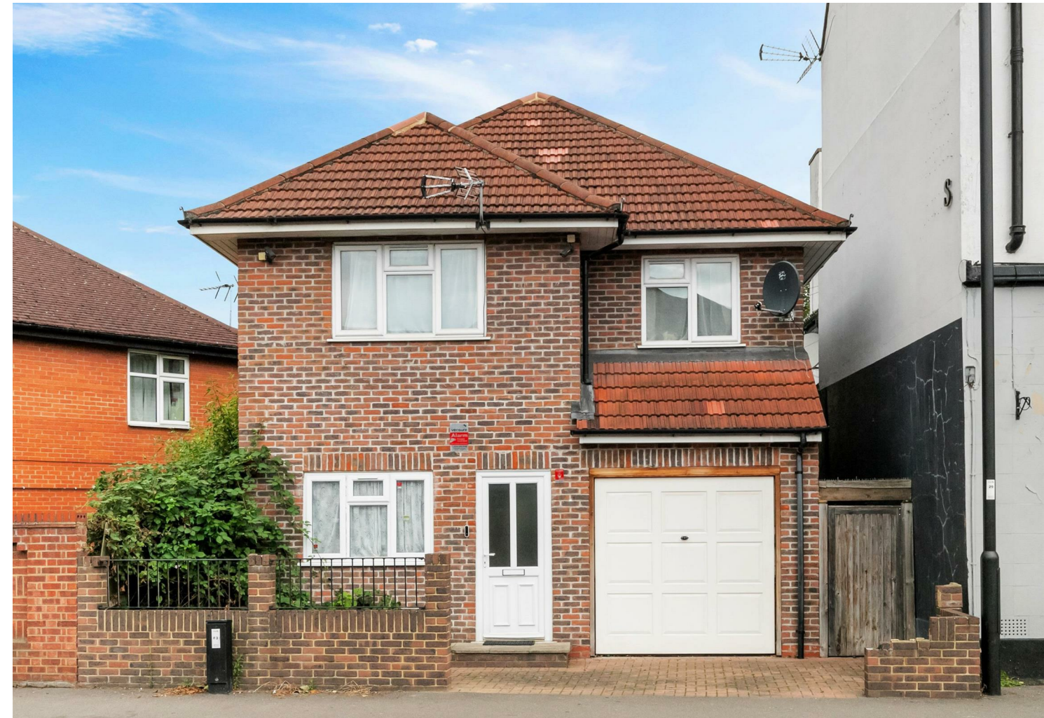
Victoria Road, London, N9 9BB

This plan is for layout guidance only. Not drawn to scale unless stated. Windows and door openings are approximate. Whilst every care is taken in the preparation of this plan, please check all dimensions, shapes and compass bearings before making any decisions reliant upon them. (ID995286)