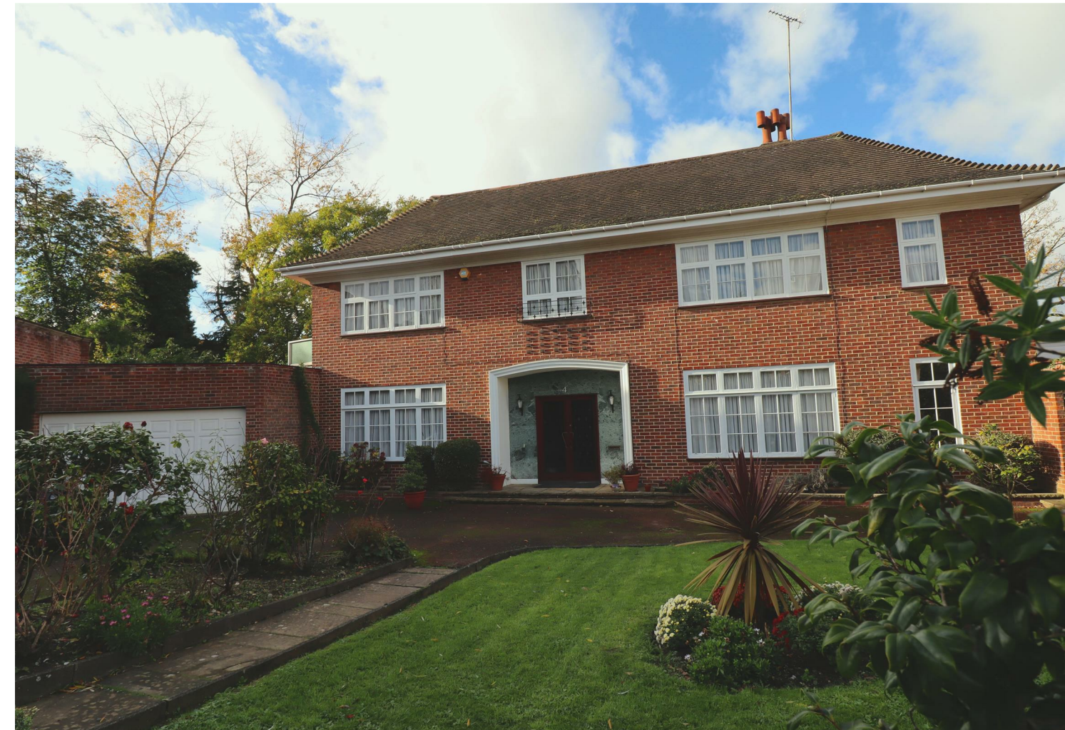
Winnington Close, London, N2 OUA

First time on the market in over 40 years! This distinguished detached home extends to a total Sq Ft of over 4600 Sq Ft and the plot measures just under half an acre, with gardens extending to 240' in width. Located on one of the most sought after cul-de-sac's in Hampstead Garden Suburb and offering great potential for the new owner to modernise to their own specification (subject to usual consents). Currently comprising 6 bedrooms, 4 bathrooms and 4 reception rooms as well as a large kitchen/diner, driveway and large garage and front garden as well as extensive rear garden.