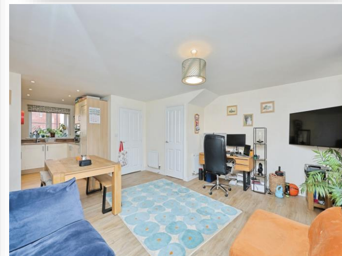
Freesia Way, Cringleford Norwich NR4 7BB