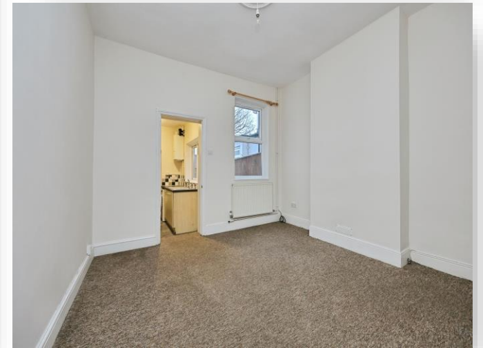
Wellington Road, Norwich NR2 3HT