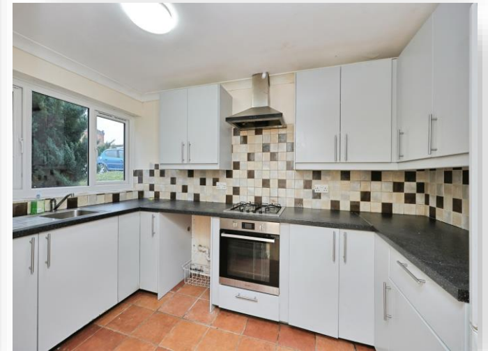
Buckland Rise, Norwich NR4 6HD