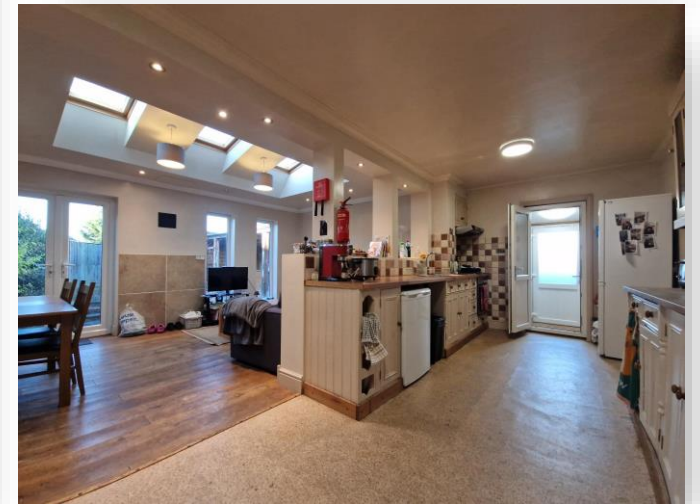
Shepherd Close, Norwich NR5 8HS