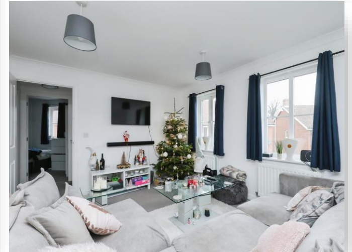
Lobelia Lane, Cringleford Norwich NR4 7JU