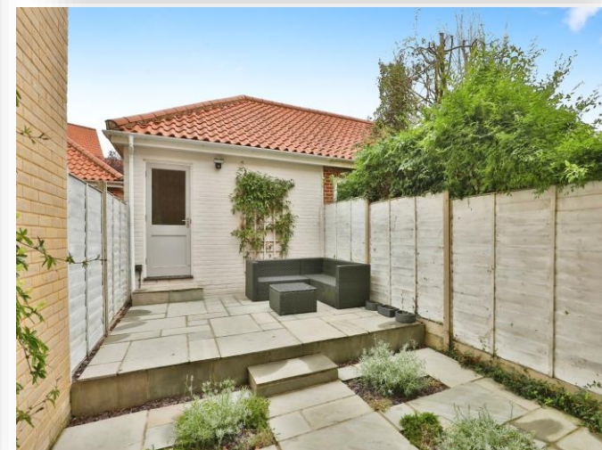
Brunswick Road, Norwich NR2 2TF