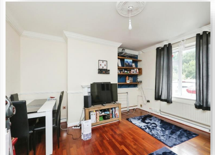
Beecheno Road, Norwich NR5 8TP