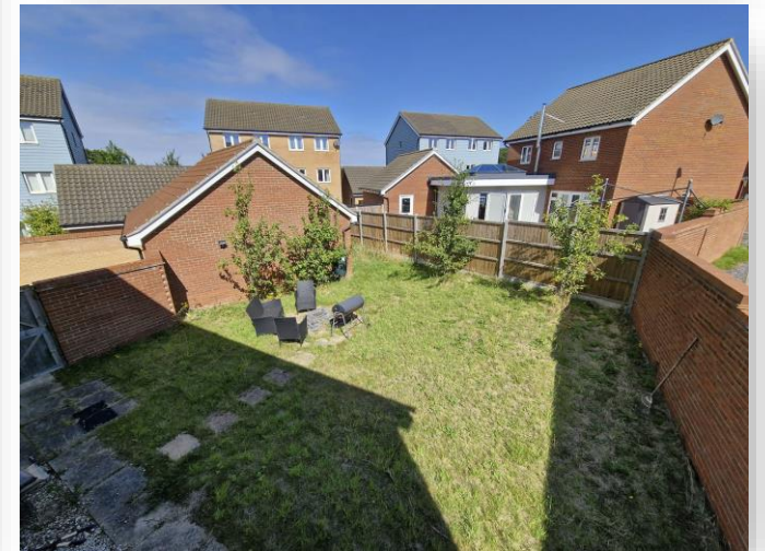
Rose Drive, Cringleford Norwich NR4 7SZ