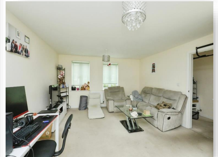
Rose Drive, Cringleford Norwich NR4 7SZ