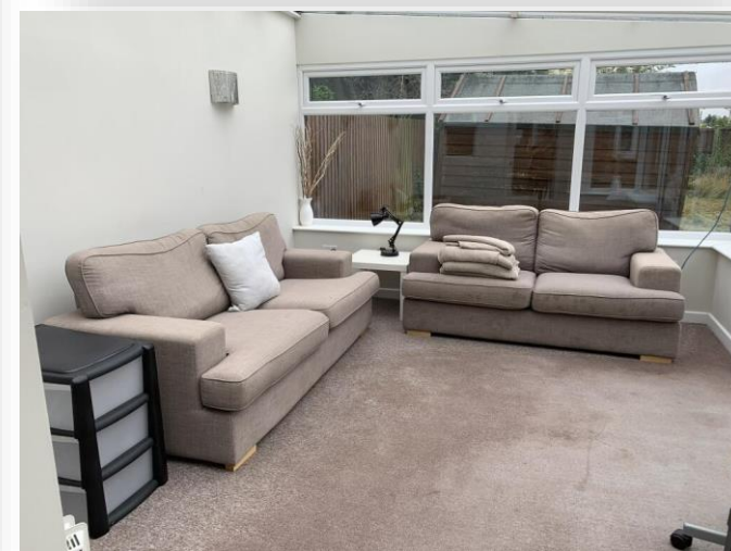
Scarnell Road, Norwich NR5 8HT