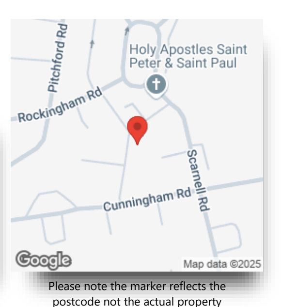
view this property online williamhbrown.co.uk/Property/UNR106026