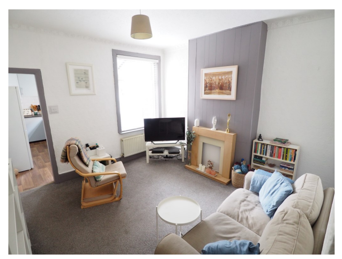
BRIGHT FRONT LIVING ROOM 12' 10" (into bay) x 8' 10"

Double central heating radiator, uPVC double glazed bay window to the front with venetian blinds, ceiling cornices.