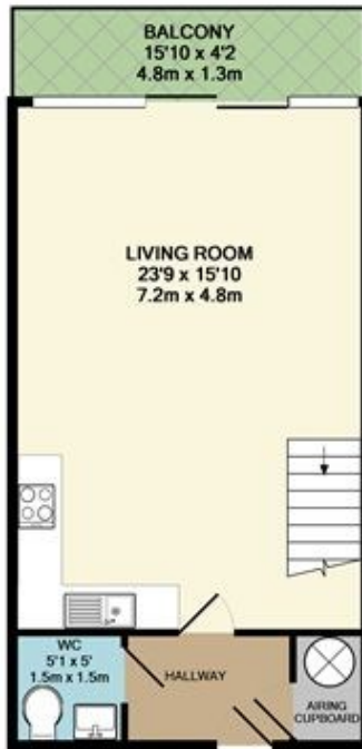
1ST FLOOR APPROX. FLOOR AREA 456 SQ.FT. (42.4 SQ.M.)