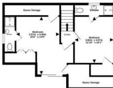
1st Floor 46.7 sq.m. (503 sq.ft.) approx.