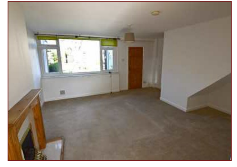
£875 Per Calendar Month