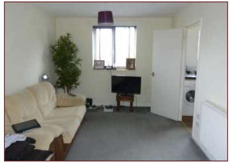
£695 Per Month