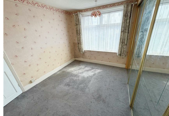
Lounge 13'6" x 12'11" (4.14m x 3.94m)