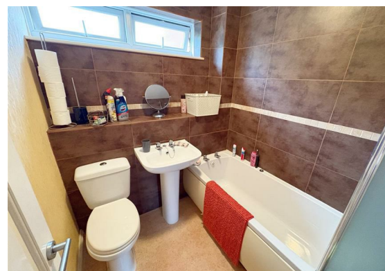
Bathroom 6'2" x 5'9" (1.88 x 1.76)