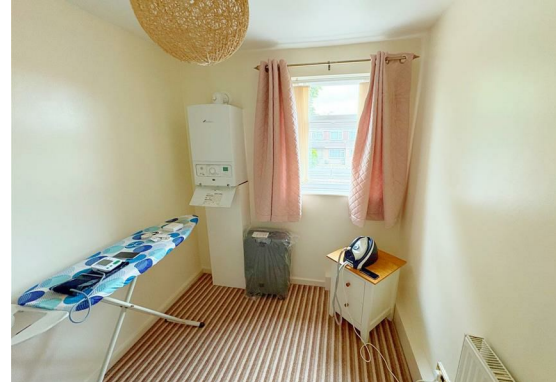
Bed 2 12'2" x 8'4" (3.71 x 2.55)