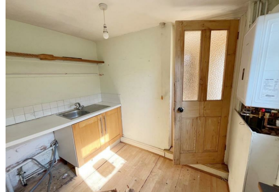
Groundfloor Bathroom 8'11" x 5'9" (2.73m x 1.76m)