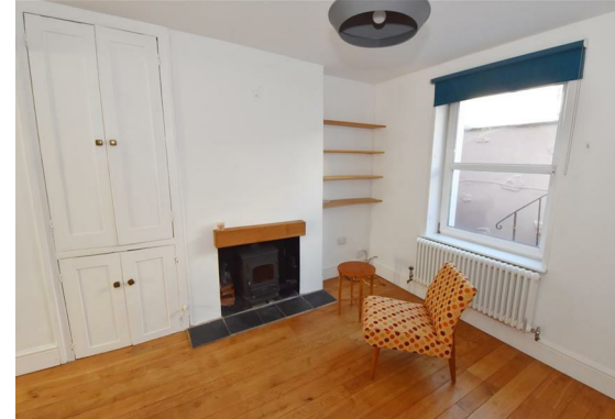
Bedroom Three 11'10" x 9'8" (3.61m x 2.95m)