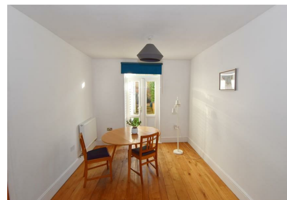
Lounge/Diner 22'7" x 11'1" (6.90m x 3.38m)