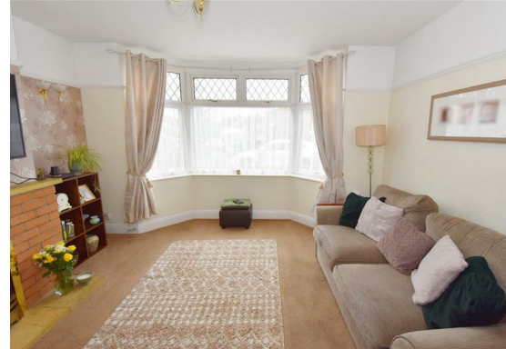
Dining Room 11'11" x 11'3" (3.64m x 3.45m)