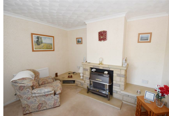
Bedroom One 13'3" x 11'9" (4.04m x 3.60m)