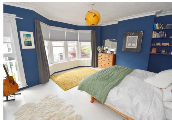
Bedroom four/loft room 14'7" x 13'3" (4.45m x 4.06m)