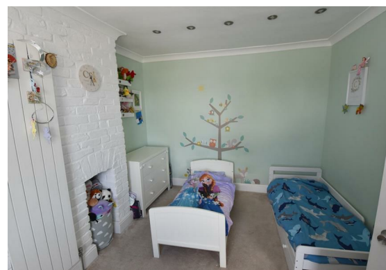
Bedroom 2 12'2" x 10'0" (3.71 x 3.05)