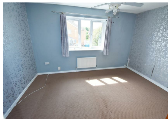
Bedroom Two 13'0" x 8'3" (3.97m x 2.52m)