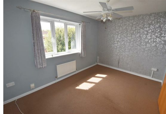
Bedroom One 13'0" x 9'3" (3.98m x 2.82m)