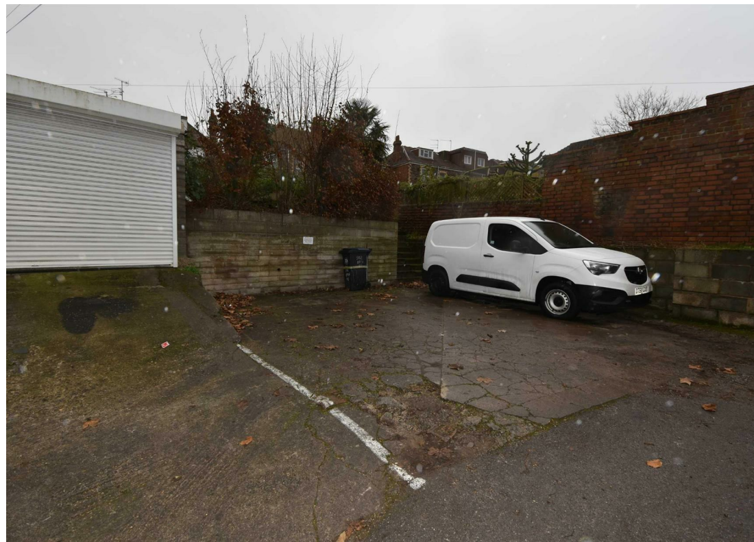
Allocated car park space Outside to front Amos Park