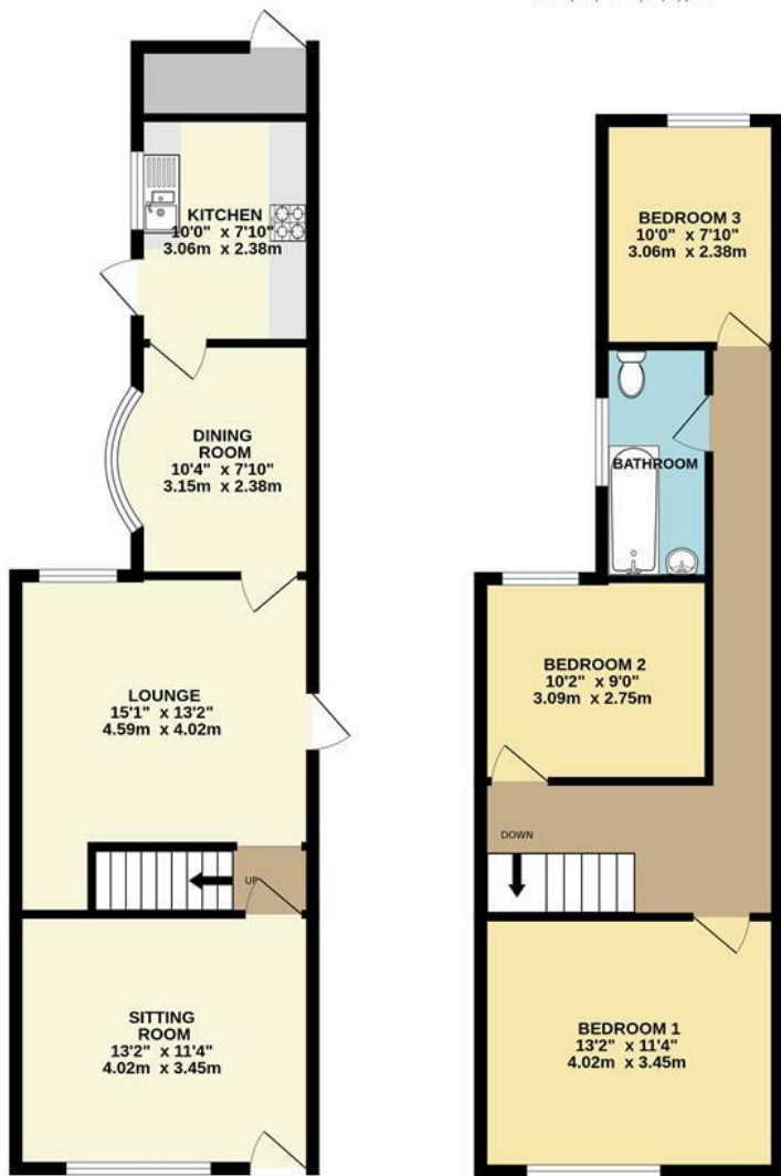
TOTAL FLOOR AREA : 1043 sq.ft. (96.9 sq.m.) approx.

Whilst every attempt has been made to ensure the accuracy of the floorplan contained here, measurements of doors, windows, rooms and any other items are approximate and no responsibility is taken for any error, omission or mis-statement. This plan is for illustrative purposes only and should be used as such by any prospective purchaser. The services, systems and appliances shown have not been tested and no guarantee as to their operability or efficiency can be given. Made with Metropix ©2025