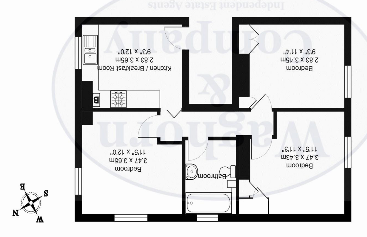
First Floor Flat