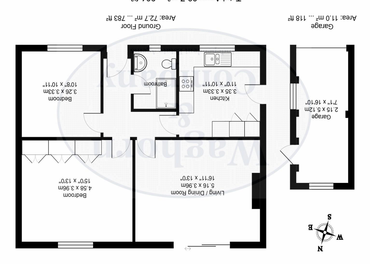
Total Area: 83.7 m^2\,\dots\,901\,\,\mathrm{ft}^2 All measurements are approximate and for display purposes only.