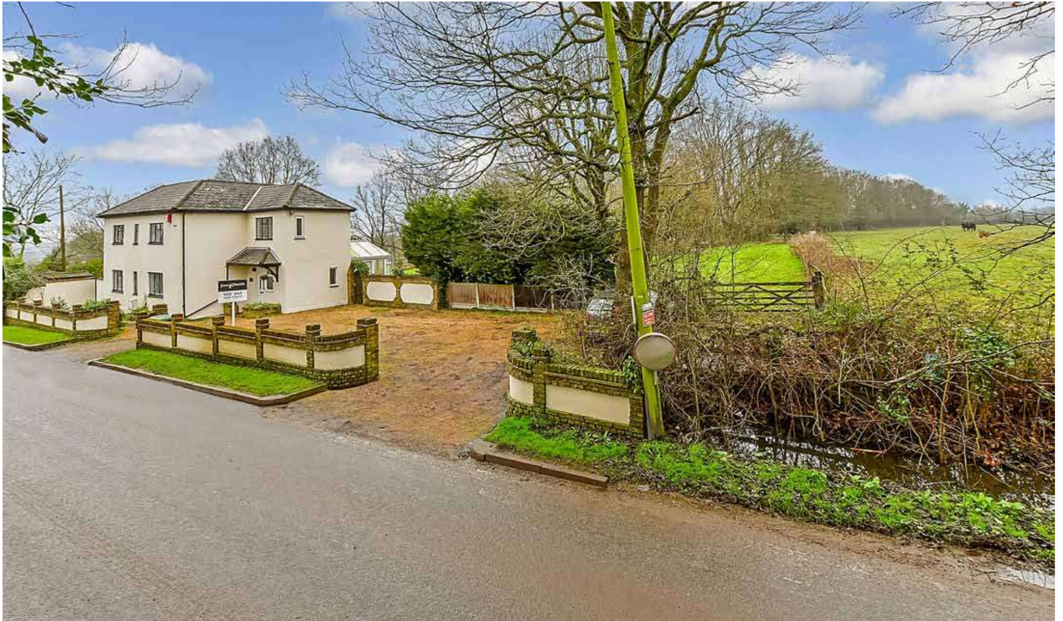
Tysea Hill Stapleford Abbots | Essex | RM4 1JU