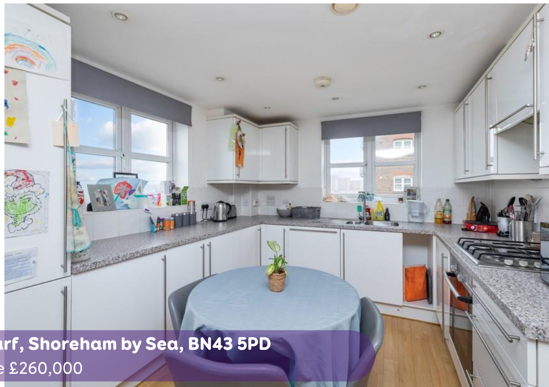
26 Sorlings Reach, Sussex Wharf, Shoreham by Sea, BN43 5PD Guide Price £260,000