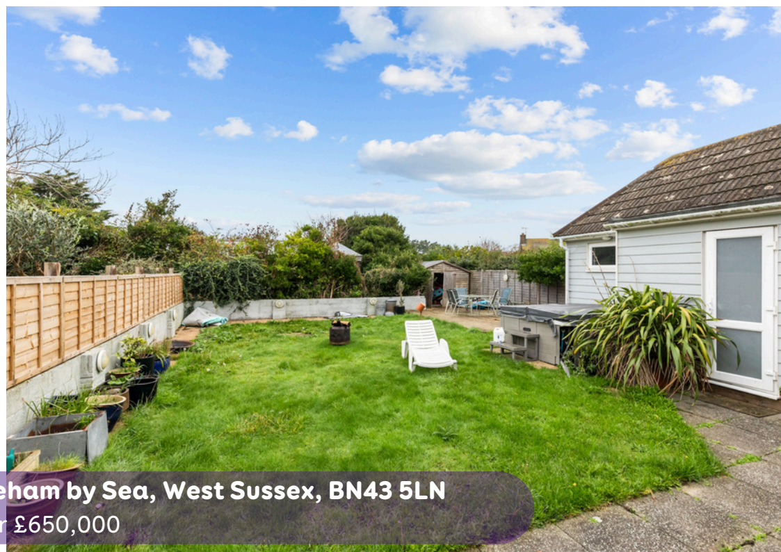
Havenside, Shoreham Beach, Shoreham by Sea, West Sussex, BN43 5LN Offers Over £650,000