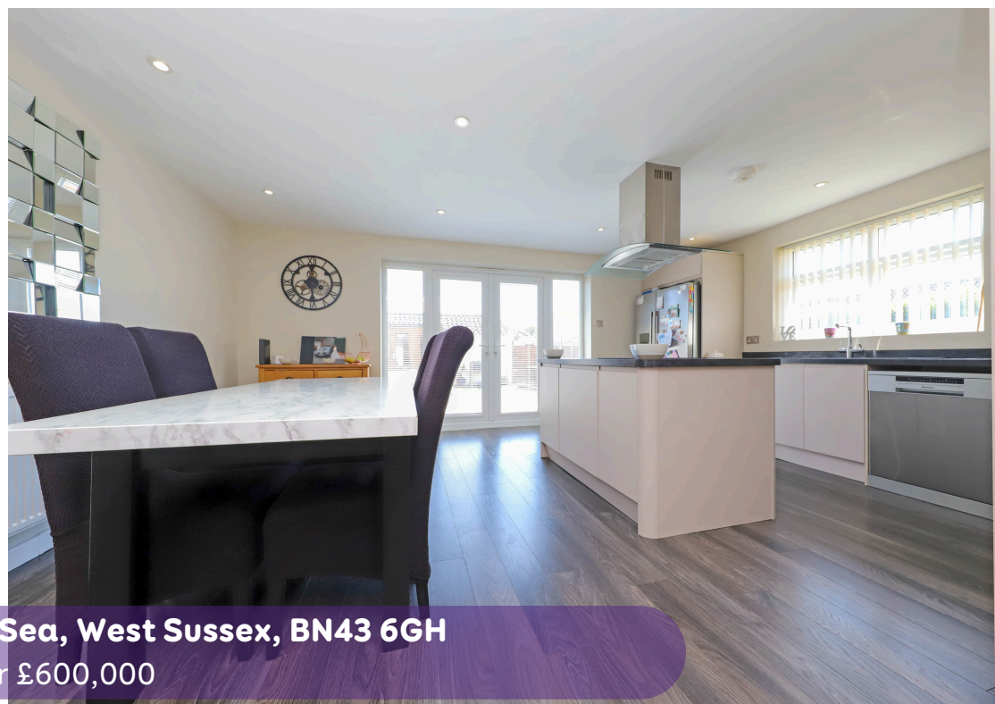
Hammy Way, Shoreham by Sea, West Sussex, BN43 6GH Offers Over £600,000