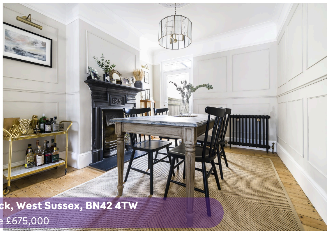
Southview Road, Southwick, West Sussex, BN42 4TW Guide Price £675,000