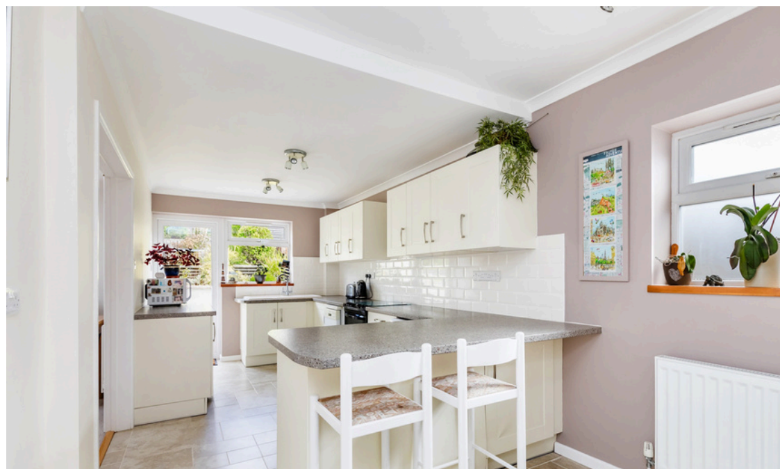
Downside, Shoreham, West Sussex, BN43 6HE Guide Price £600,000