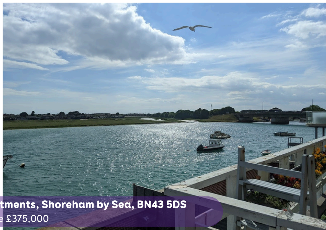
Riverside House, Town Quay Apartments, Shoreham by Sea, BN43 5DS Guide Price £375,000