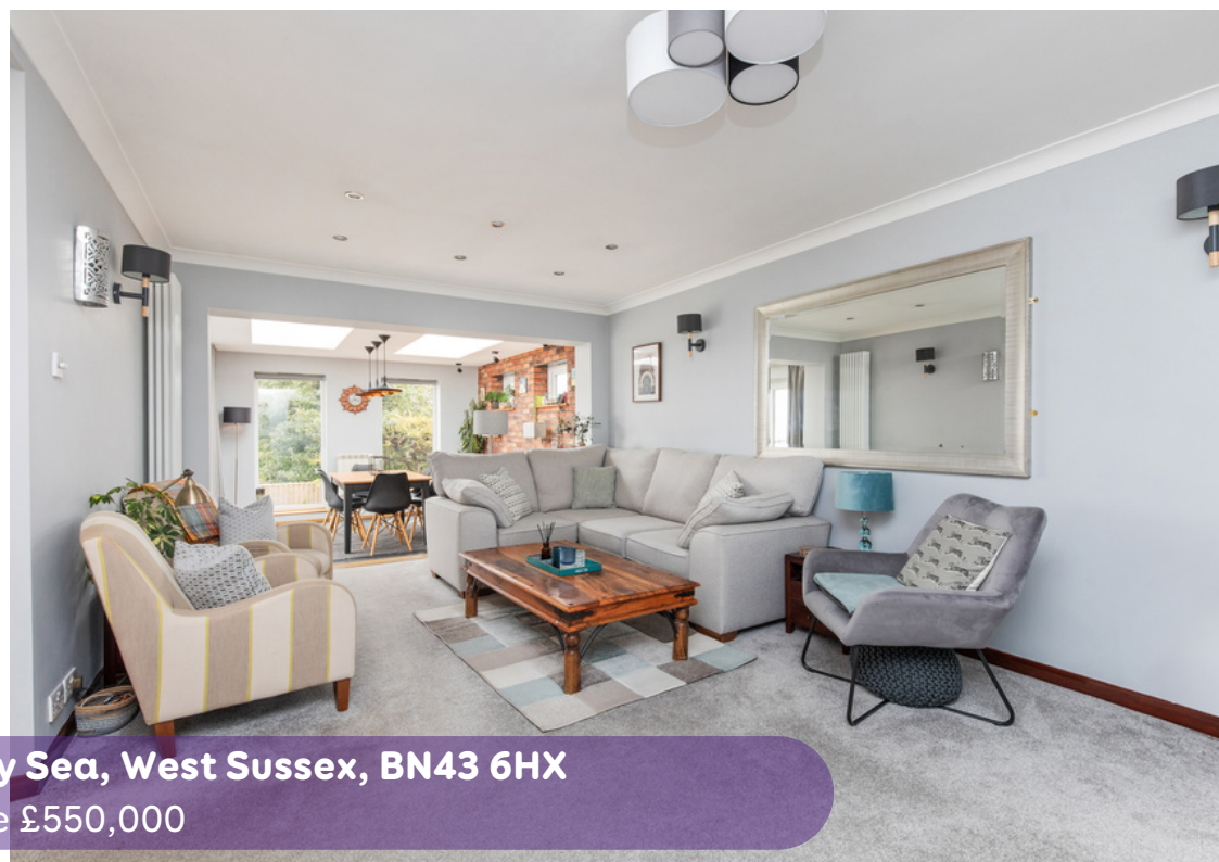
Slonk Hill Road, Shoreham by Sea, West Sussex, BN43 6HX Guide Price £550,000